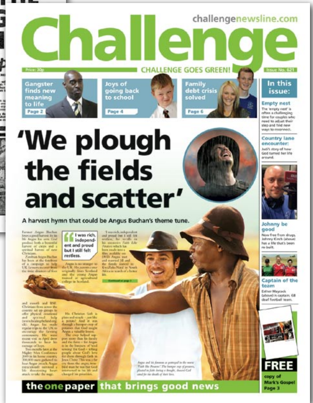
The September 2009 edition with its new contemporary look, for churches to use in outreach.