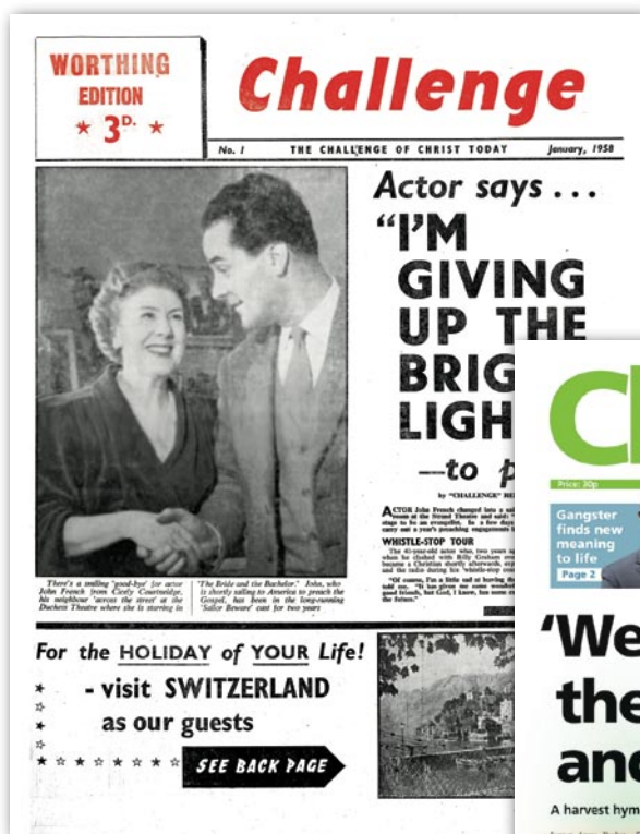
The first issue of Challenge back in 1958.